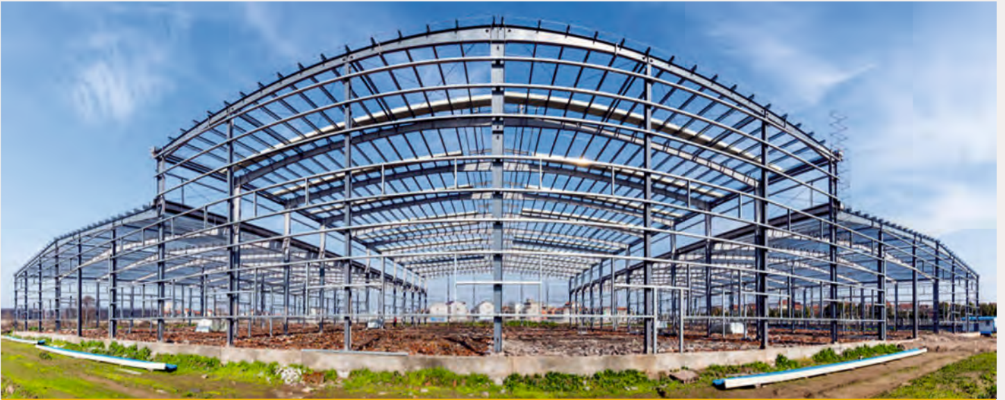
Structural Steel Work